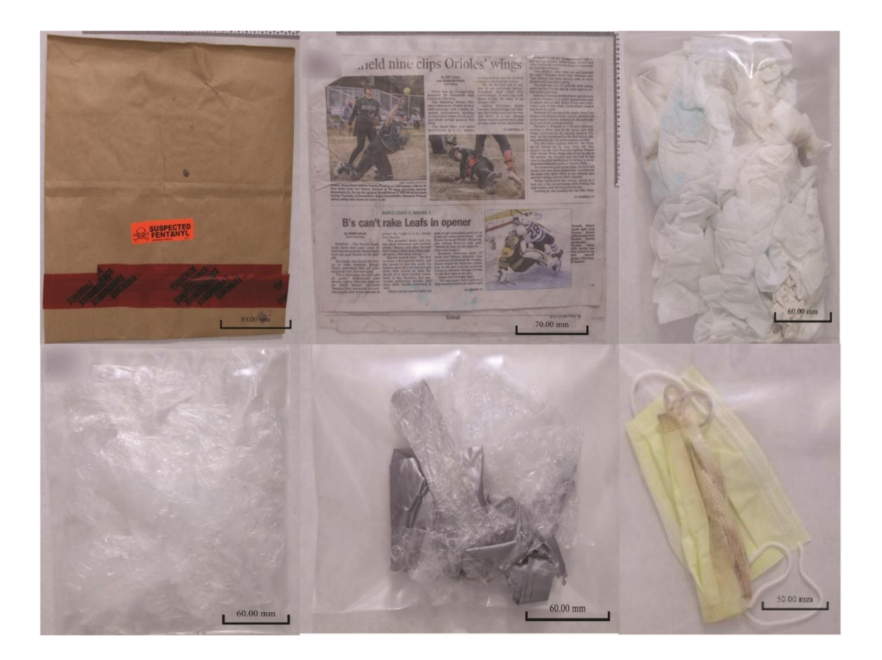
Figure 1: Images of the samples submitted for analysis.

acquisition time of 20 seconds and a scan rate of 5 Hz.